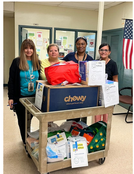
Members enjoying our Meeting and program!